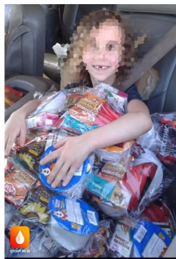
Faces blurred for privacy actual students receiving our snack packs